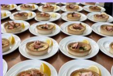
Hot Smoked Salmon Tart